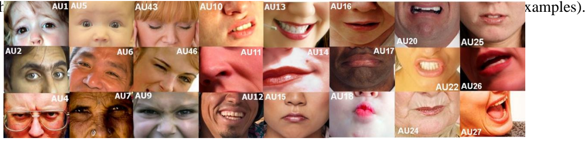
Figure 1: Examples of AUs