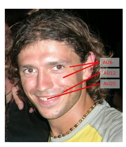
Figure 2. Typical smile includes activation of AU6, AU12 and AU25.

proposed systems that are able to recognize these six basic emotions. Almost all proposed emotion detectors recognize emotions directly from raw data. In this CBC we will use a different approach to emotion detection. Instead of directly classifying a set of features extracted from the images into emotion categories, we will use AUs as an intermediate layer of abstraction. The rules that map AUs present in a facial expression into one of the six basic emotions are given in Table 1. In this CBC we will not use these rules directly but instead we will try to learn emotional classification of AUs using different machine learning techniques. Also, in this CBC we consider the step of AU detection to be solved. Students are provided with a dataset that consists of a list of AUs and the corresponding emotion label.