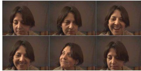
Figure 3: Example frames from an automatically extracted segment from SEMAINE-DB capturing the transition from a negative to a positive emotional state and back.

Segmentation Driven by Matched Crossovers : This procedure (illustrated in Algorithm 4) takes the output of Algorithm 3, and attains the sets of matched crossovers (Algorithm 3, lines 6-7). An iteration for all sets of matched crossovers for to-Negative transition is shown starting in line 7. mcos , mcos(i).f and mcos(i).c represent the current matched crossover, the frame where the i -