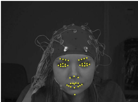
Figure 3: An example of the recorded camera view including tracked facial points.

We expected the ERP responses to appear in 400ms to 600ms after showing the tag. Therefore, the EEG signals of the one second period after displaying overlaid tags under the images were downsampled 16 times and used as features. As a result, we had 32 \times 16 = 512 features for every trial.