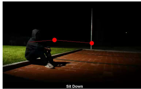
Figure 2: Example image depicting a human action including a relevant tag ('Sit Down') as shown to the subjects. Part of the recorded eye gaze fixation and scan path of one subject is overlaid in red.

the two-dimensional coordinates of the projection of the eye gaze on the screen. An example of an eye gaze pattern and fixation points on an image is shown in Figure 2. The scan path is the eye gaze trajectory in transition from one fixation to another. The image zone and the tag zone were defined on the screen based on the way the images were positioned on the display and the image size, which was constant. The features extracted from eye gaze are listed in Table 1.