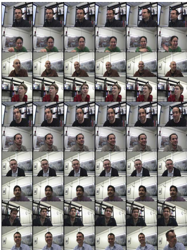
Fig. 1. Example laughter segments for the subjects

visible. We included some barely audible laughs and laughter overlapping with speech, in contrast to [17, 18] where no speech was included in the laughter segments. Some examples of laughter segments are displayed in Fig. 1. We made sure no smiles occurred in the non-laughter instances. To test the validity of the class-labels, two other annotators annotated the corpus. One annotator rated 4 laughter-instances as non-laughter, the other annotator agreed completely, resulting in an agreement of 97.7%. Of all the 180 instances, 59% contains speech of the visible participant. Almost all instances contain background speech. Together these instances form 25 minutes of audio-visual data. The dataset is available at http://hmi.ewi.utwente.nl/ami-laughter .